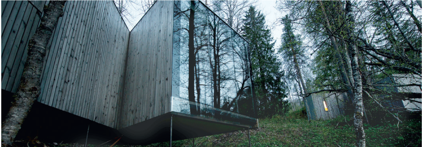
Juvet Landscape Hotel

Our ancestors the Vikings were good storytellers – and their stories have survived because they had the ability to fire the imagination of the listeners and remain in their hearts and minds.