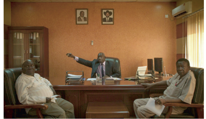
Meet the Censors