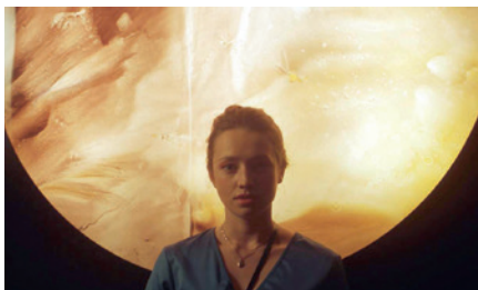
Dates in Real Time