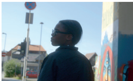
Verden er min