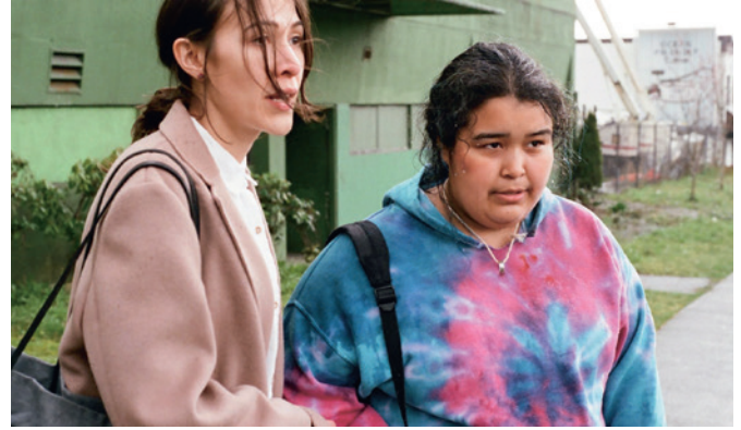
The Body Remembers When the World Broke Open